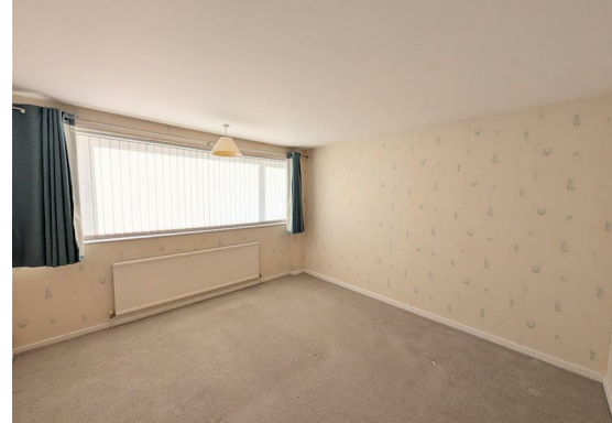
Entrance Hall 6'0 x 11'0 (1.83m x 3.35m)